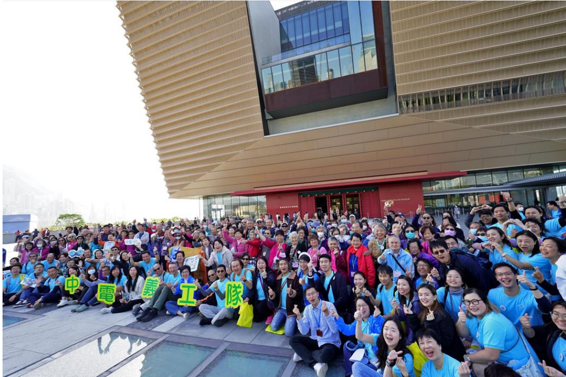
CLP volunteers accompany more than 300 elderly people to visit the Hong Kong Palace Museum to celebrate the Senior Citizens Day.