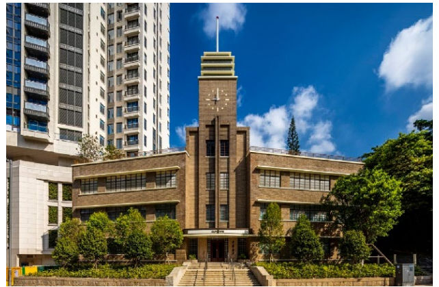
Taken in 2023