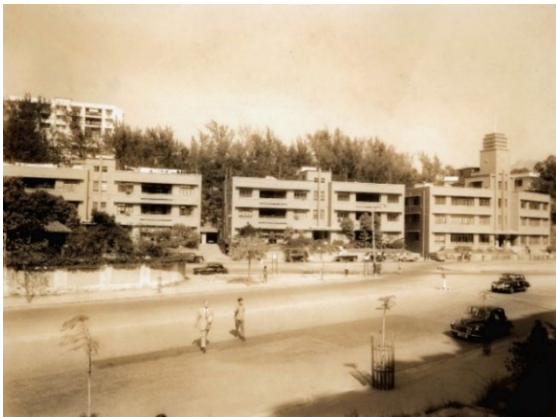
Taken in 1951